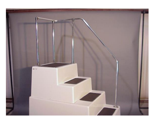
Figure 5 Figure 6